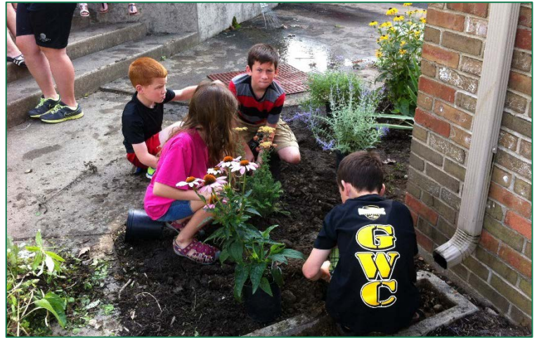
Crossroads RC&D Conservation Fund