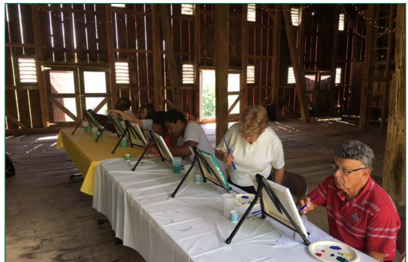
Electric Service to Norma Johnson Center