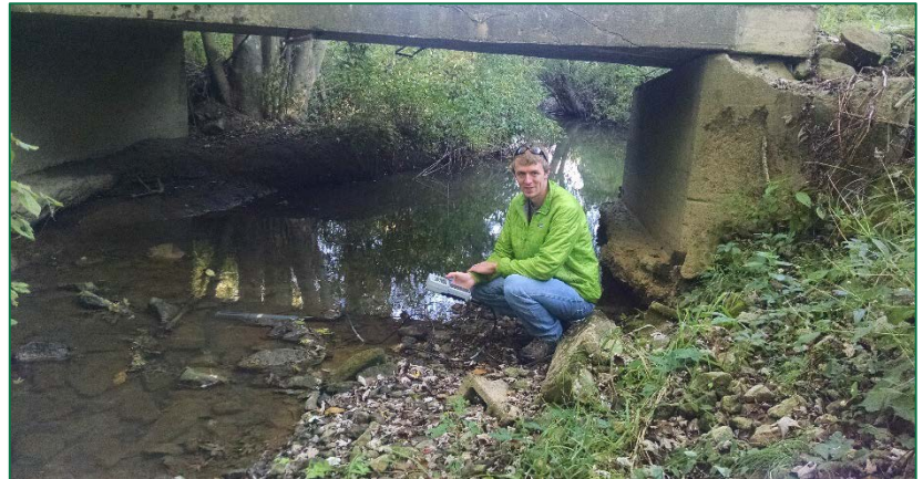
Water Quality Monitoring in MWCD Watersheds