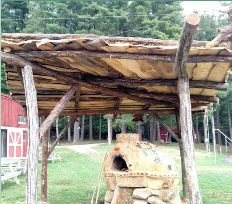
Wood Fired Outdoor Pizza Kitchen with Earthen Oven Camp Roosevelt-Firebird