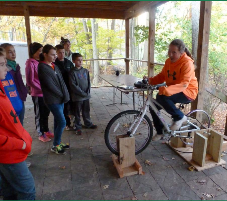
Green Energy Class Camp Nuhop