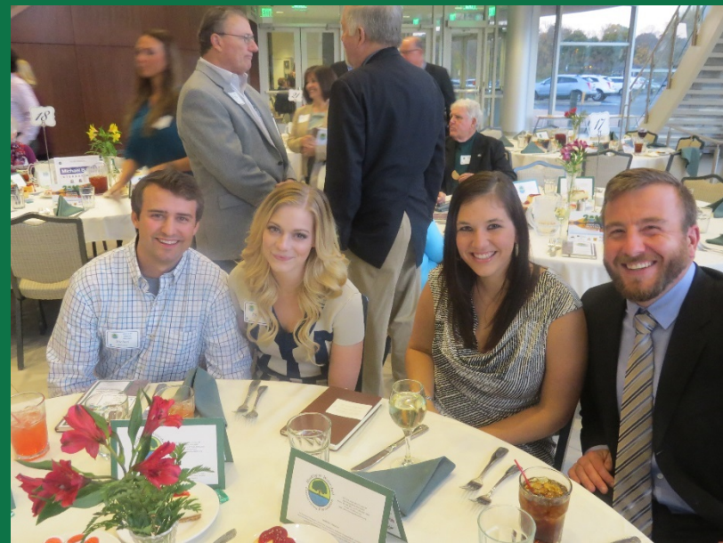
Meeting attendees enjoying fellowship at the Annual Meeting