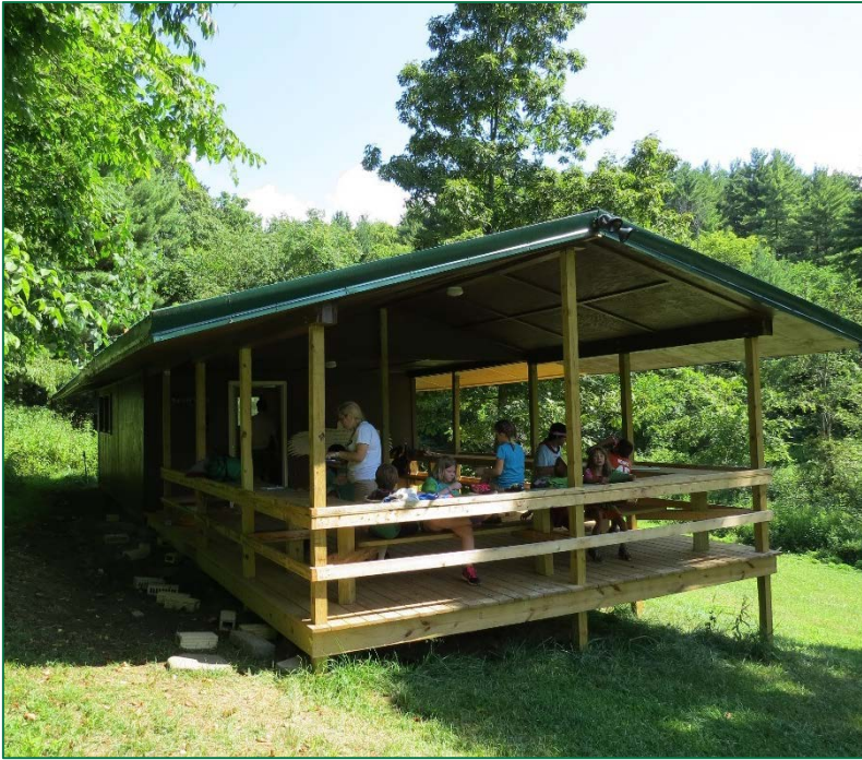
Environmental Education Displays YMCA Camp Tippecanoe