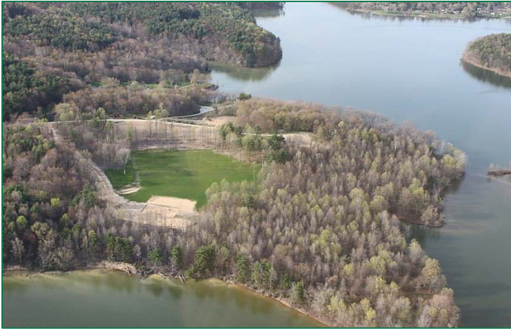
Atwood Lake Park Amphitheater Fund