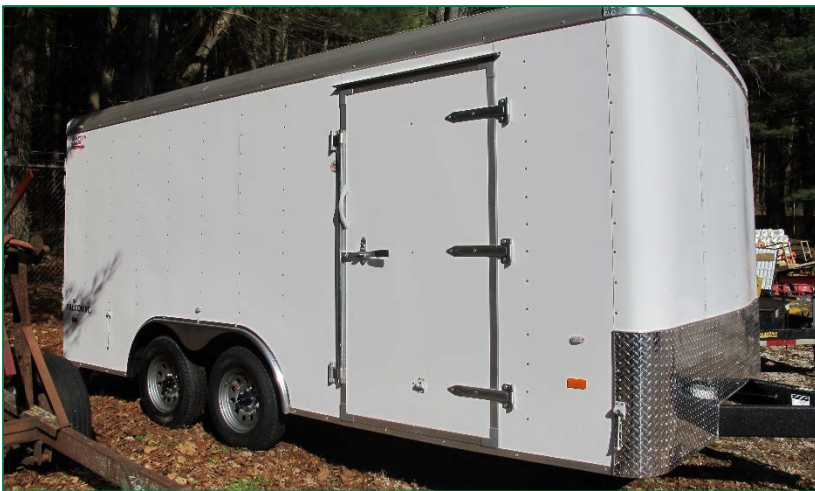
Charles Mill Kayak Trailer