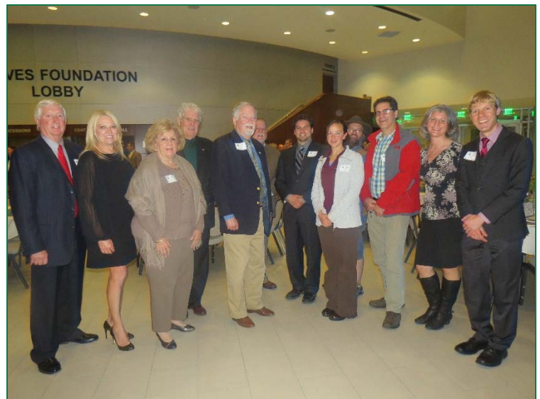
Trustees with Youth Camp Mini Grant Award Recipients