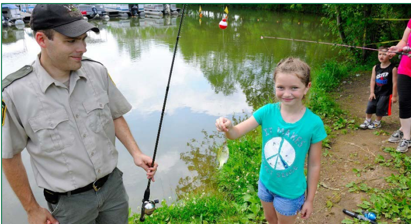
2016 Safe Boating & Fishing Festival