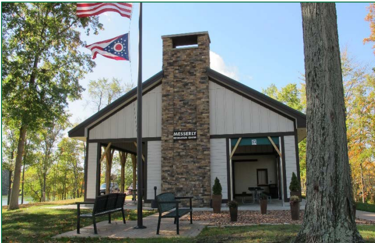
Messerly Recreation Center Fund

Established by the Belmont Better Hunting and Fishing Club, this fund supports improvements at Piedmont Lake, particularly increasing fish populations.