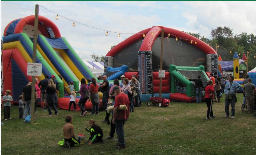
Atwood Fall Festival Kid's Zone