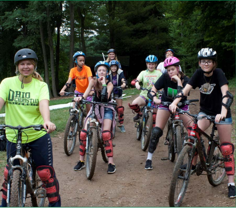
Pedal Preservation Project Pleasant Hill Outdoor Camp