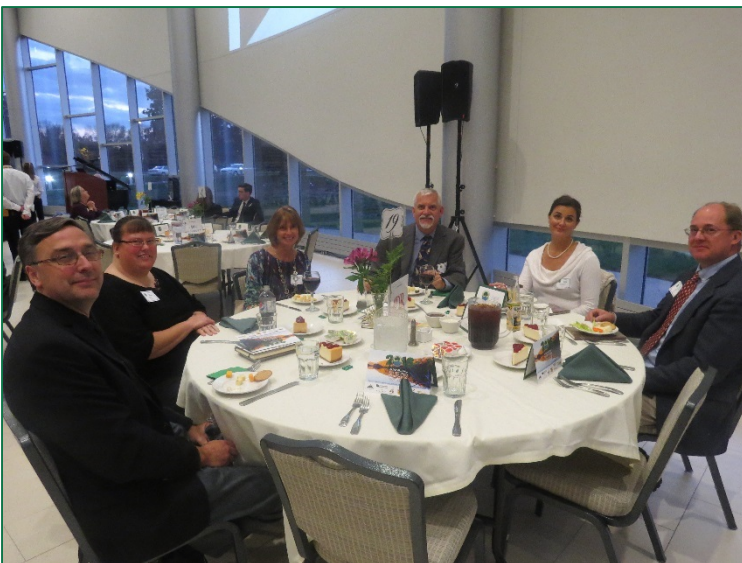
Meeting attendees enjoying dinner at the Annual Meeting

Proceeds from the event will again support the 2017 Mini Grant Program. The 2017 Annual Meeting will be held at the Performing Arts Center on Friday, November 3.