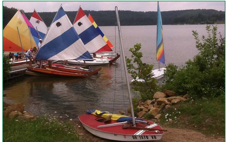
Boating Safety and Education Fund