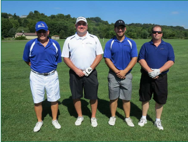
1 st Place: Team Omnipro Services