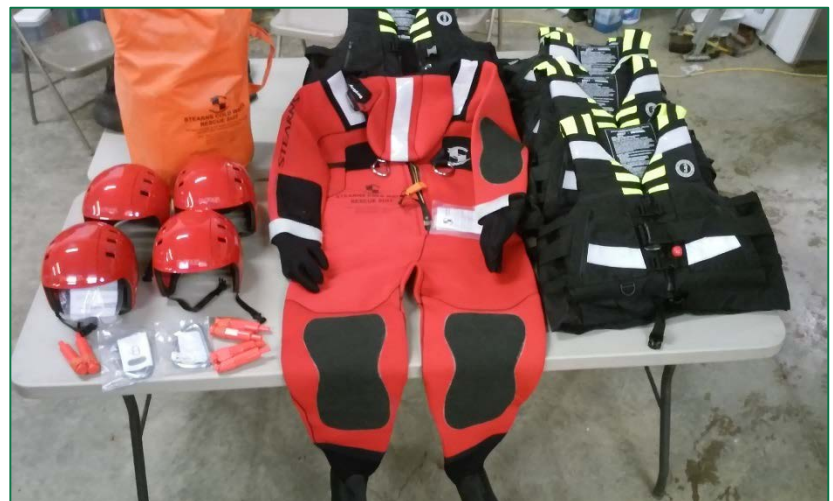
Sherrodsville VFD Water Rescue Equipment