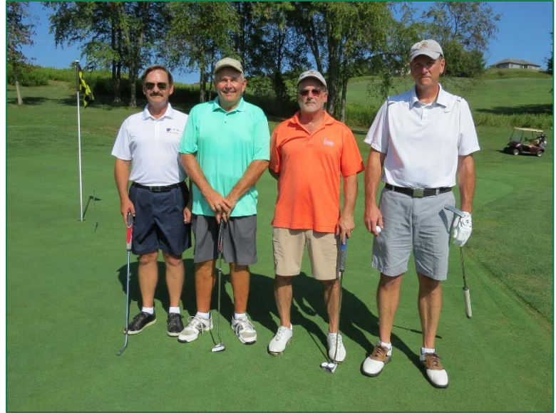
2 nd Place: Team Bible