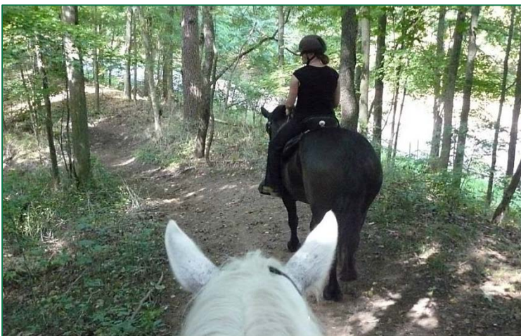
Pleasant Hill Equine Fund