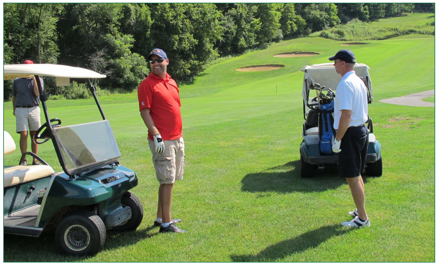
Team Stantec prepares for its second shot on Hole 4