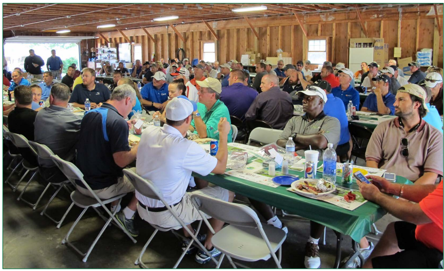
Awards reception following steak dinner