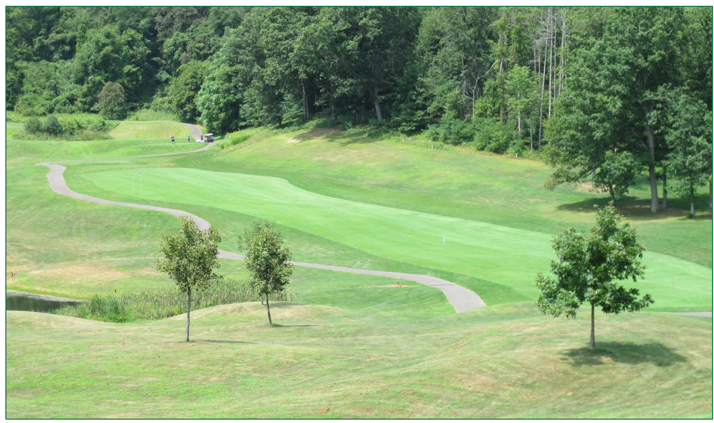
Mark your calendar!

The 18<sup>th</sup> Annual Muskingum Watershed Conservancy Foundation Golf Outing will be held on Thursday, August 11, 2016 at Oak Shadows Golf Club in New Philadelphia. Hope to see you then!