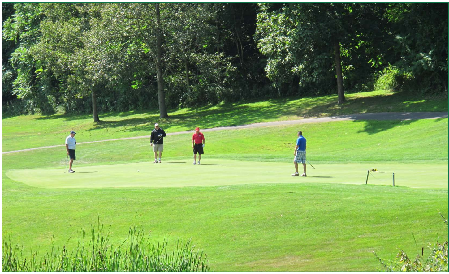
Team S&ME assesses the green on Hole 3