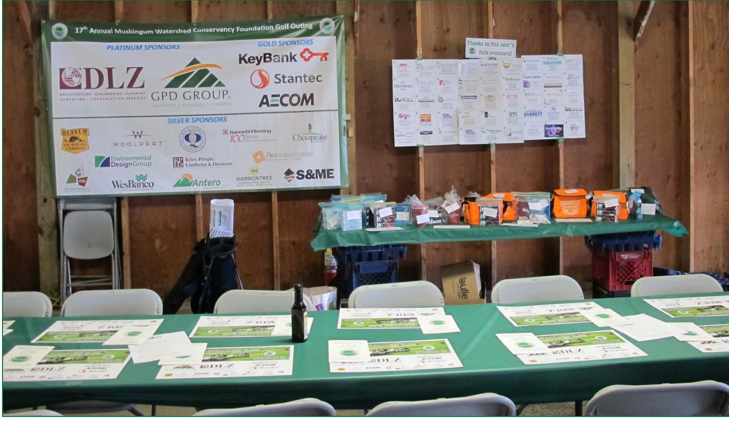
Platinum, Gold, and Silver Sponsors Banner, Hole Sponsors board, and door prizes on display before the reception