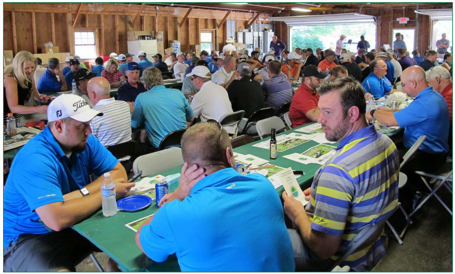
Golf Outing participants enjoying the steak dinner and networking