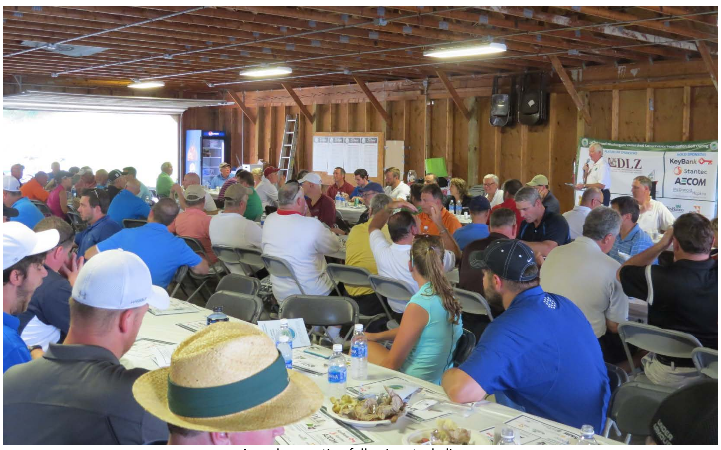
Awards reception following steak dinner