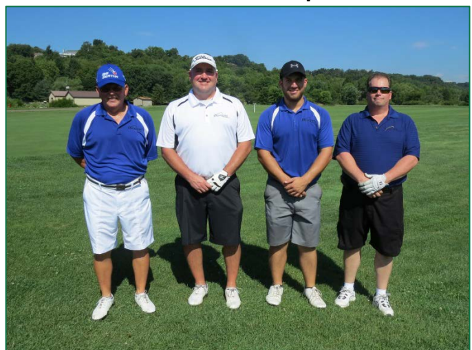
First Place – Team Omnipro Services