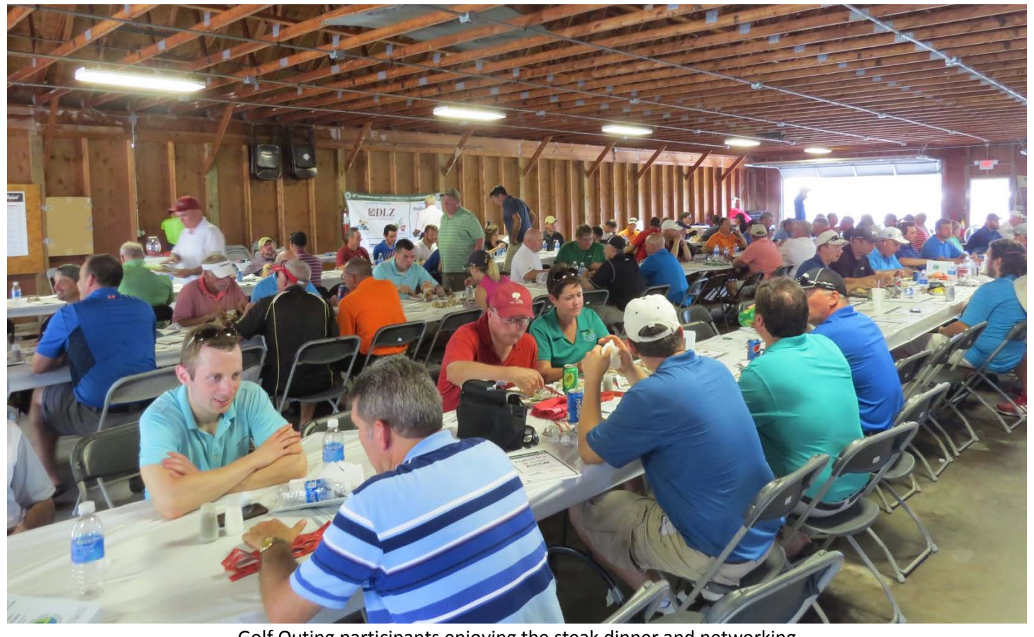
Golf Outing participants enjoying the steak dinner and networking