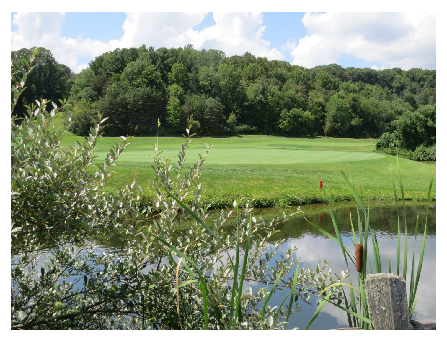
Mark your calendar!

The 19<sup>th</sup> Annual Muskingum Watershed Conservancy Foundation Golf Outing will be held on Thursday, August 10, 2017 at Oak Shadows Golf Club in New Philadelphia. Hope to see you then!