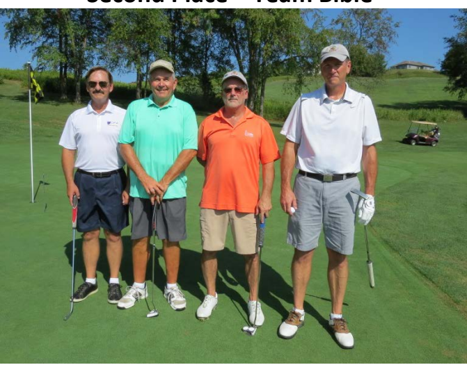
Second Place – Team Bible