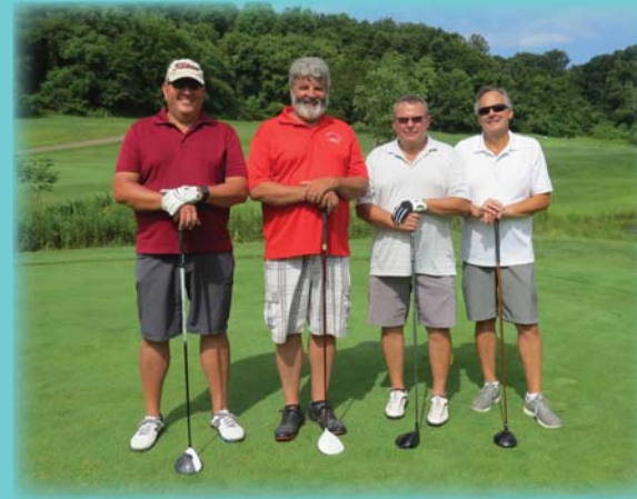
FOURTH PLACE Team USGS In a tie-breaker with a score of 58 (14 under par)