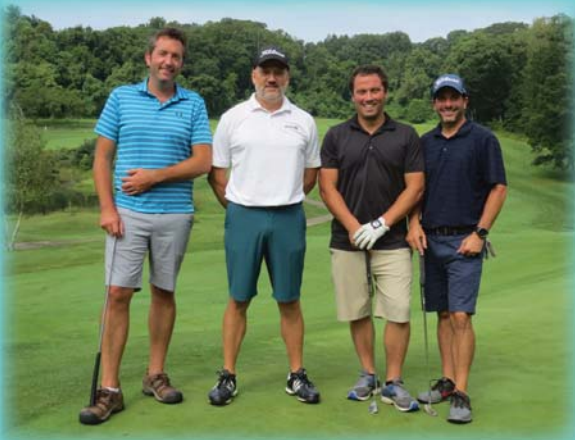
THIRD PLACE Team AECOM In a tie-breaker with a score of 58 (14 under par)