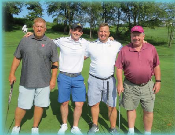
SECOND PLACE Team ms consultants In a tie-breaker with a score of 58 (14 under par)