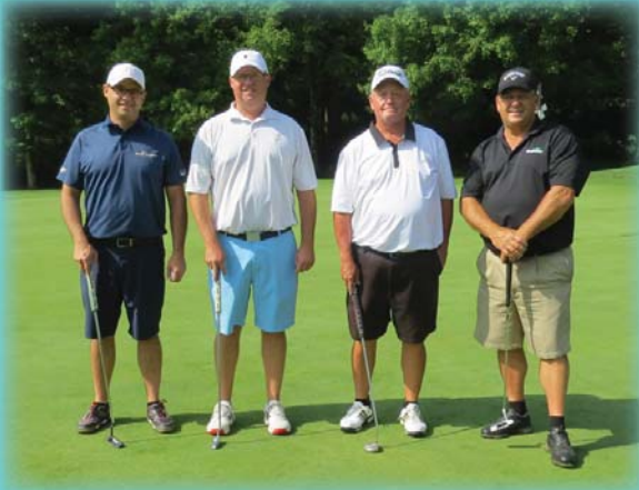
FIRST PLACE Team WesBanco With a score of 54 (18 under par)