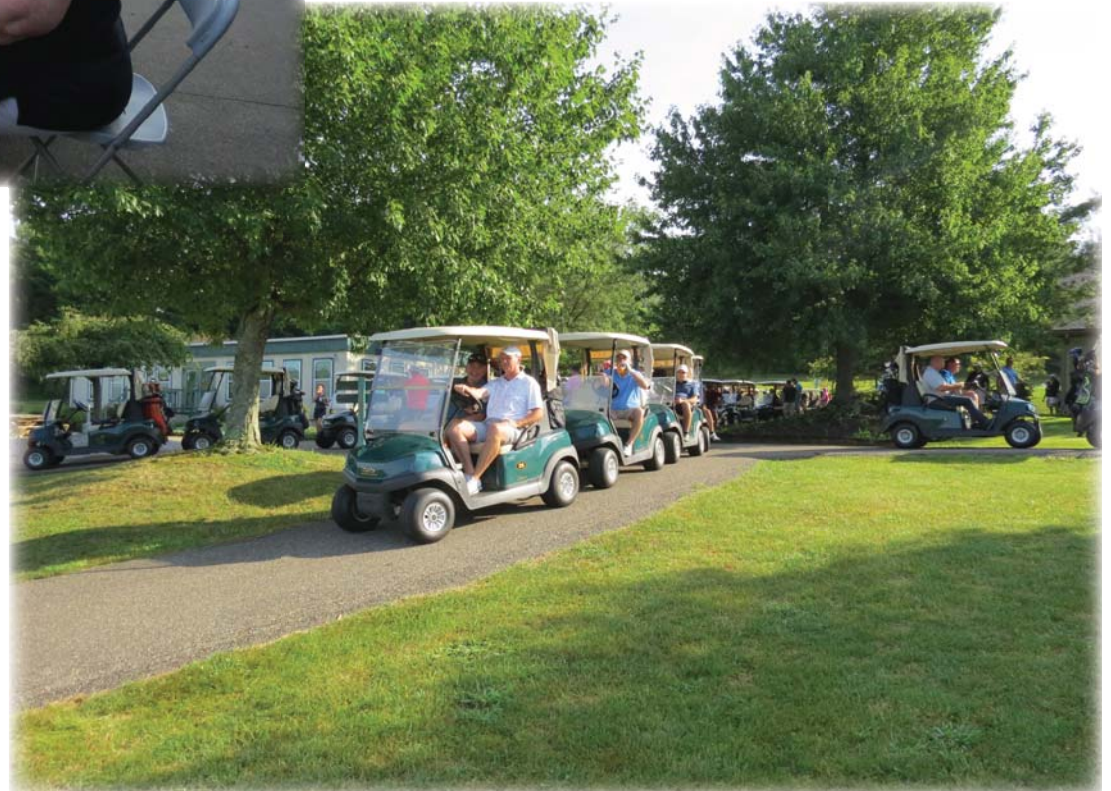
The golf carts are lined up and ready to go out on the golf course! "Start your engines!"